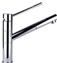
Mixer Tap Lorenzo 8466 000